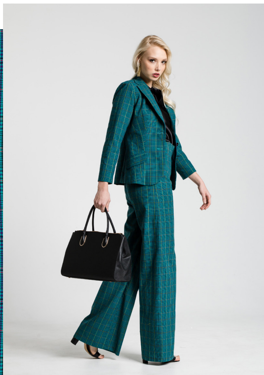
AZ T 003 CARNEGIE HIGH WAIST, WIDE LEG PANTS AVAILABLE IN JADE TARTAN